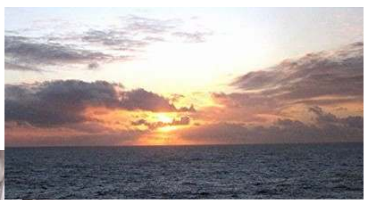
currently raging in the world. The other storm is off the coast of Greenland.

During the night the Amsterdam cleared the stormy area and we enjoyed breakfast with smooth seas and a beautiful sunrise. We heard later that we had brushed up against one of two unusually violent storms